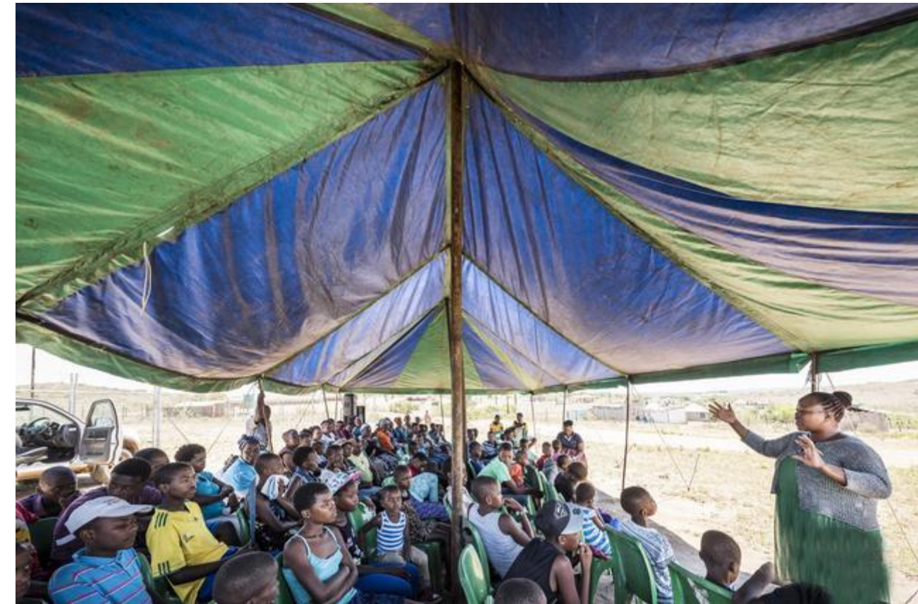
Photography of a health awareness roadshow in the Ophondweni area, South Africa, 2016.