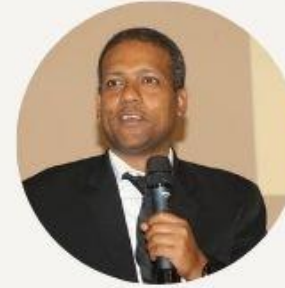
DR MUNIR KASSA

Minister of Health, Democratic Republic of the Congo