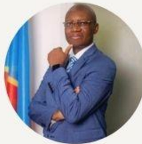
H.E. DR. ROGER KAMBA

Minister of Health, Democratic Republic of the Congo